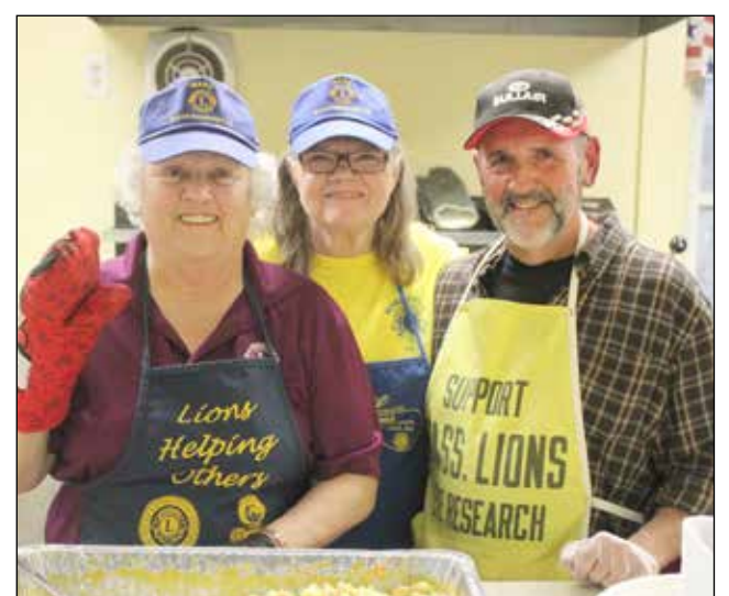
Turley

Please send your questions by email to pouimette@turley.com by March 27.