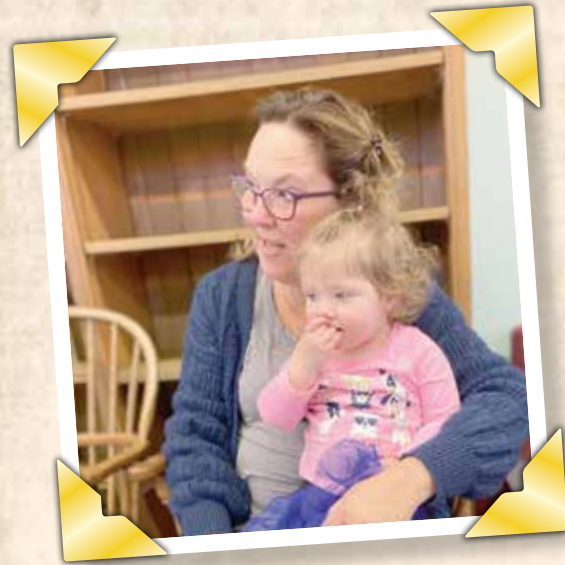
If you recognize the folks in this week's photo, please send their names and your full name to pouimette@turley.com.

Each week the Ware River News digs into its submitted photo archives and selects a people photo to publish. We need your help to help identify those pictured.