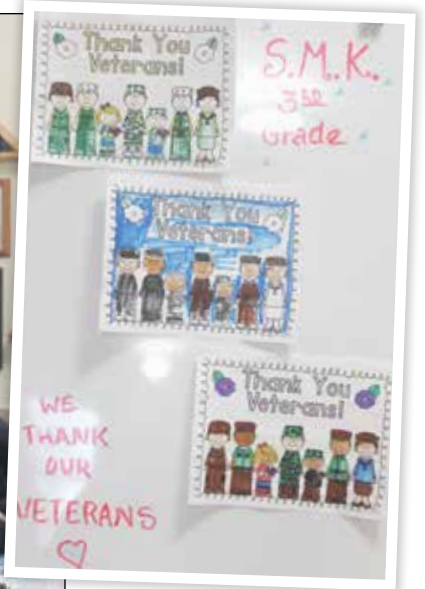
Third grade students of Stanley M. Koziol Elementary School provided coloring sheets to thank the veterans. These sheets are hung up inside the American Legion.