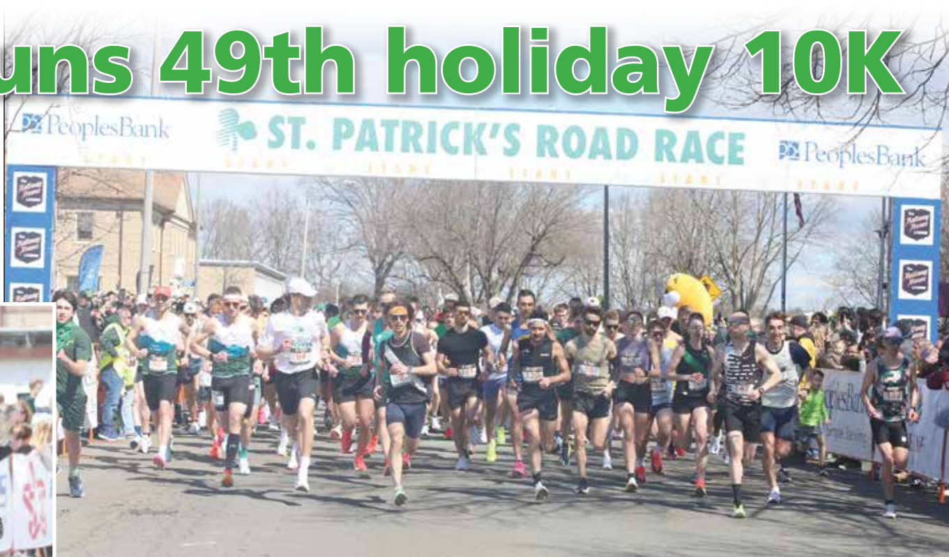
The runners are off in the 49th running of the Holyoke St. Patrick's Day Road Race.