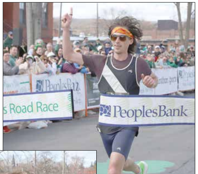
Turley

Last Saturday's even included a fun run for children and a walk as well that have been traditions in recent years. Prior to the race, there were musical performances and other entertainment downtown.