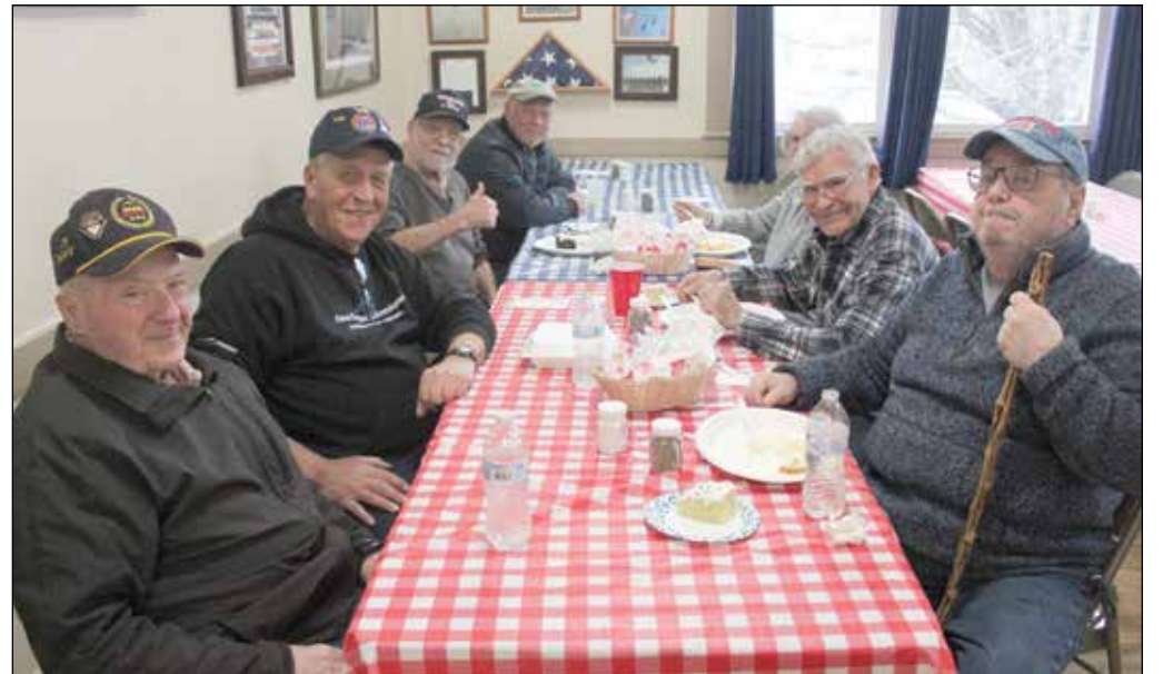
A table full of veterans enjoyed chicken pot pie for dinner and cake for dessert at the Veteran Appreciation Dinner hosted by the Ware Lions Club.